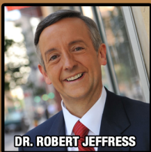
DR. ROBERT JEFFRESS